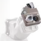
2012 BY-PASS VALVE/SBP