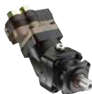
2008 SCPD 56/26